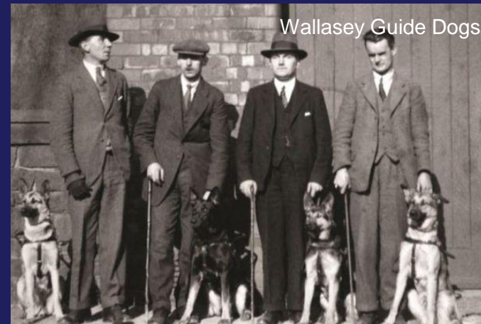
Wallasey Guide Dogs