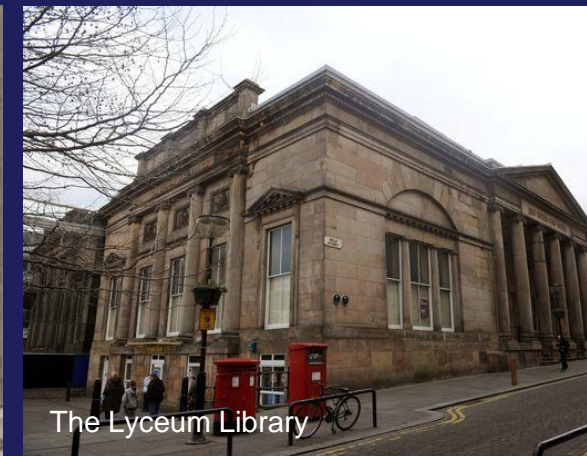
The Lyceum Library